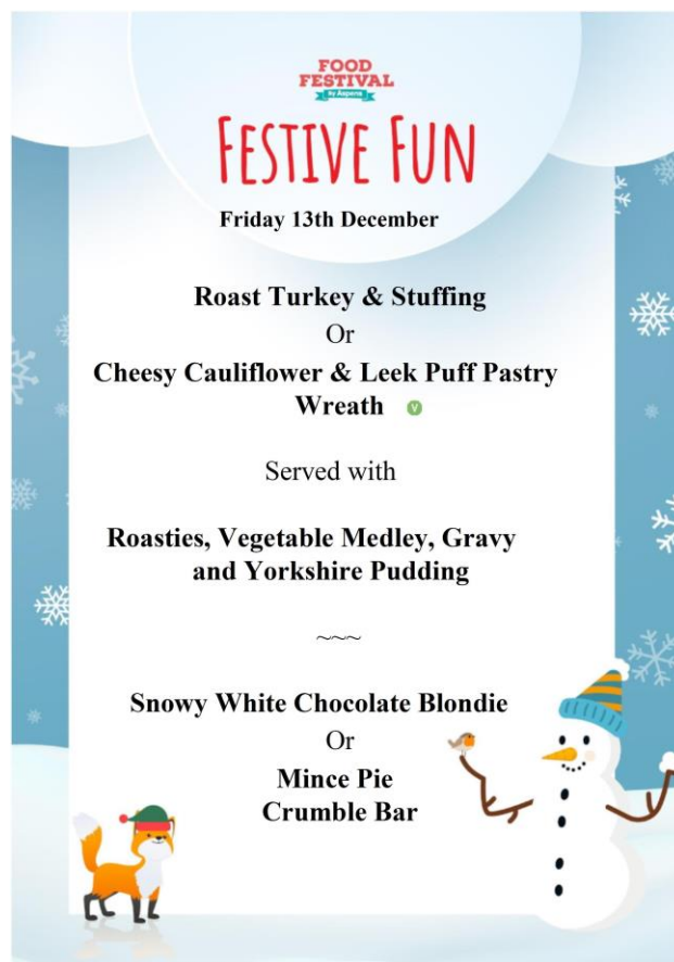
1 - Christmas Dinner Menu