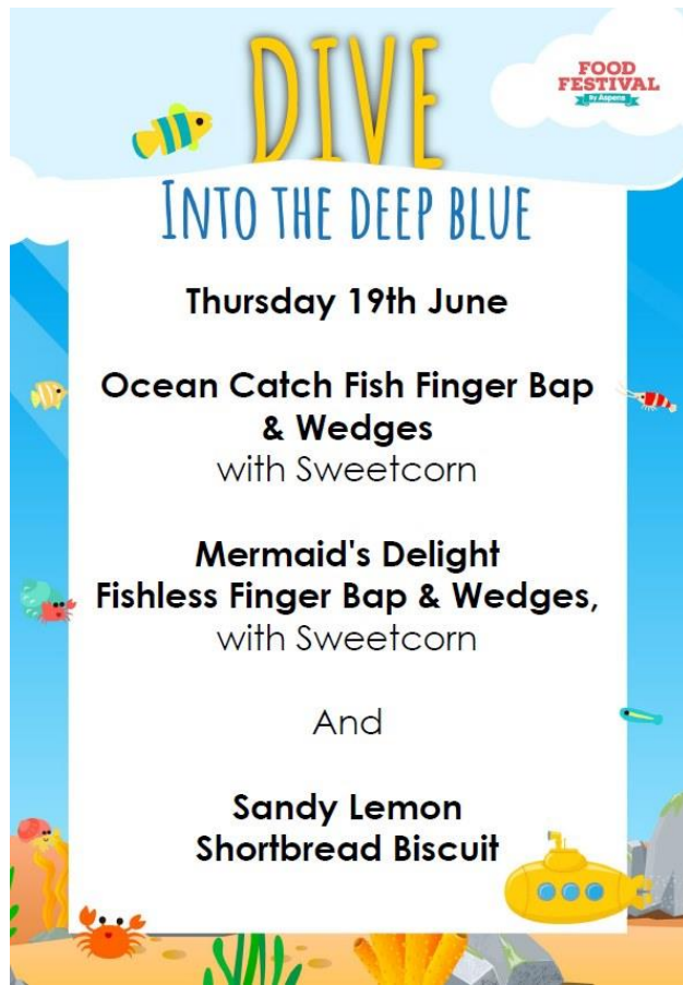
Menu Nutritional Analysis for Dive into the Deep Blue Primary Theme Day June 25